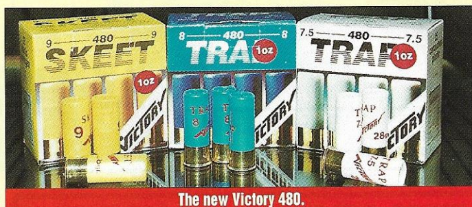
The new Victory 480.